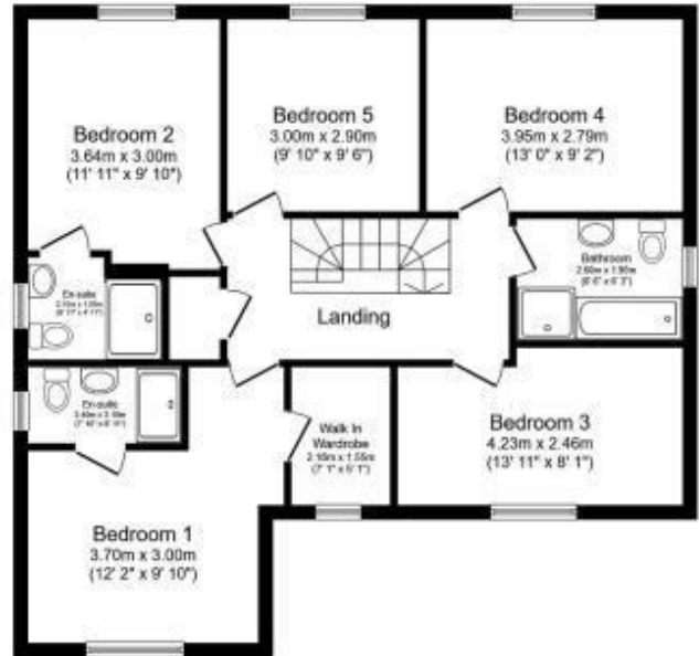
First Floor Floor area 84.7 sq.m. (912 sq.ft.)

Total floor area: 175.8 sq.m. (1,892 sq.ft.)